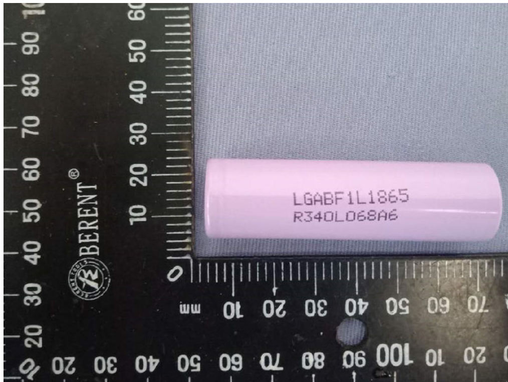
Figure 3 Overall view of cell