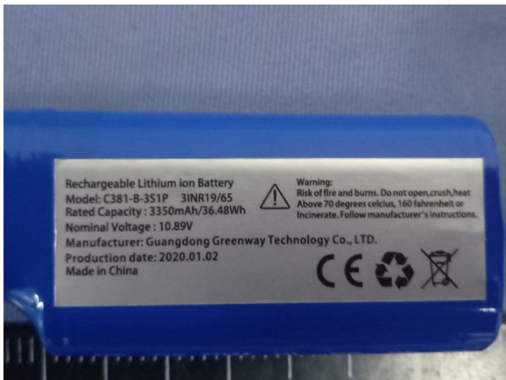
Figure 4 Battery Label