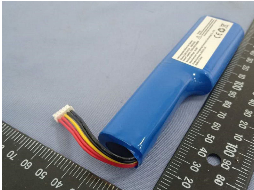
Figure 2 Overall view II of battery